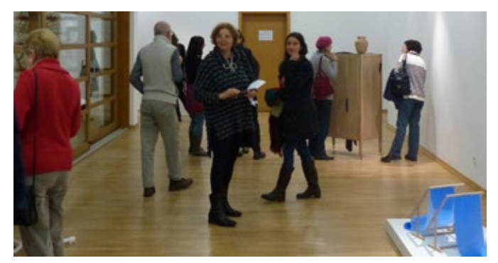
Opening of the exhibition "Contiguous Notes" Installations, Paper and Text Works by Shiroki Asako and Liv Strand. The exhibition is on display at the JDZB from 22 February until 6 April 2016.