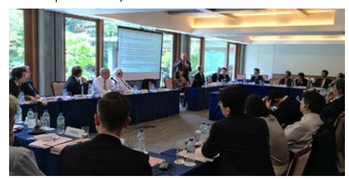
Workshop on "Compliance" held on 22 April 2016 in Tōkyō. This was the fourth event held in cooperation with the German-Japanese Association of Jurists (Hamburg) and concludes the series on this subject.