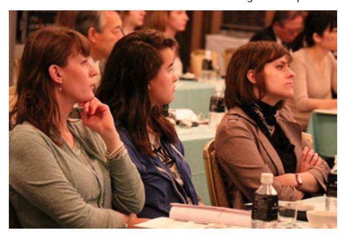
Conference "Economic Growth and the Role of Women - Implications of the G7 for Gender Equality" held on 18 April 2016 in Tōkyō. In cooperation with the Japan Office of the Konrad Adenauer Foundation, speakers and participants from Asia and Europe — especially female — discussed socio-economic and political roles of women.