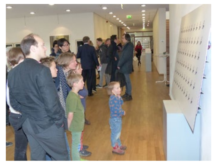
Opening of the exhibition "Expression of Entropic Sound, Intimations of Immortality" by the sound artist Shirao Kanari and the photographer Sirio Magnabosco on 28 April 2016. The exhibition can be viewed at the JDZB from 29 April 29 until 6 June 2016.