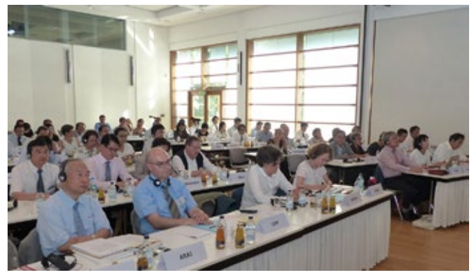
Symposium "Protection Law and Guardianship Law" held at the JDZB on 12 September 2016, with the Japan Adult Guardianship Association (Tōkyō) and the Guardianship Court (Bochum), in the context of the 4<sup>th</sup> World Congress on Guardianship Law in Erkner near Berlin (14-17 Oct).

Conference "Electricity Systems of the Future, Electricity Networks and Storage" on November 1, 2016 at the JDZB, with the German Federal Ministry for Economics and Energy, ECOS Consult and the New Energy and Industrial Technology Development Organization (Tōkyō).