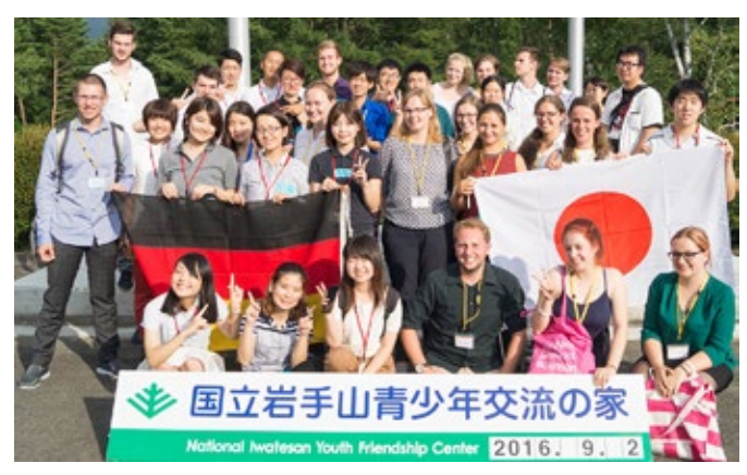
German delegation of the German-Japanese Exchange Program for Young Volunteers, together with volunteers from the National Iwatesan Youth Friendship Center in Iwate Prefecture in September 2016.