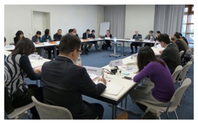
Introductory Seminar for the Japanese Delegation of the German-Japanese Study Program for Experts in Children and Youth Work on 14 November 2016 at the JDZB.