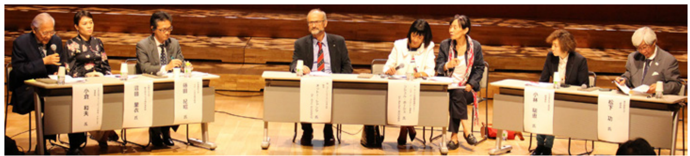
Symposium "Sports, Arts and Inclusion" on 29 September 2017 in the Tōkyō University of Arts, in cooperation with the Nippon Foundation Paralympic Support Center (Tōkyō) and the Tokyo University of Arts. Against the background of the upcoming Olympic and Paralympic Games in Tōkyō 2020, questions about the social integration of people with disabilities through art and sports were discussed.

German-Japanese Security Dialog held on 14 November 14 2017 in the Kasumigaseki Plaza Hall in Tōkyō, in cooperation with the Federal Foreign Office (Berlin), the Ministry of Foreign Affairs (Tōkyō), the Konrad Adenauer Foundation (Tōkyō) and the Japan Institute of International Affairs (Tōkyō). Discussions dealt with the question of how to handle an insecure world order and possibilities for German-Japanese cooperation.