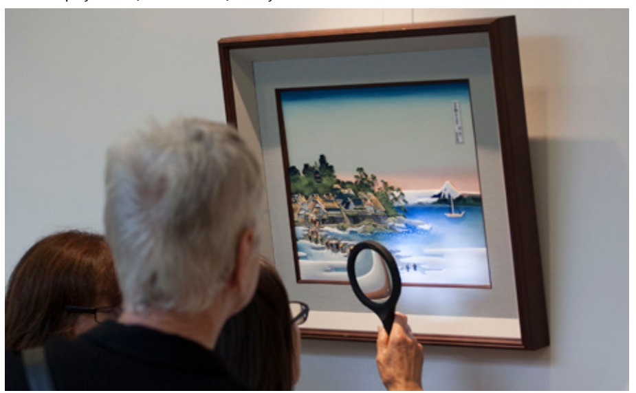
Opening of the exhibition "The Great Wave of Kanagawa – 36 Views of Mount Fuji" with silk relief paintings by the Keyakinokai group at the JDZB on 1 September 2017. The exhibition was on display at the JDZB until 20 October 2017.