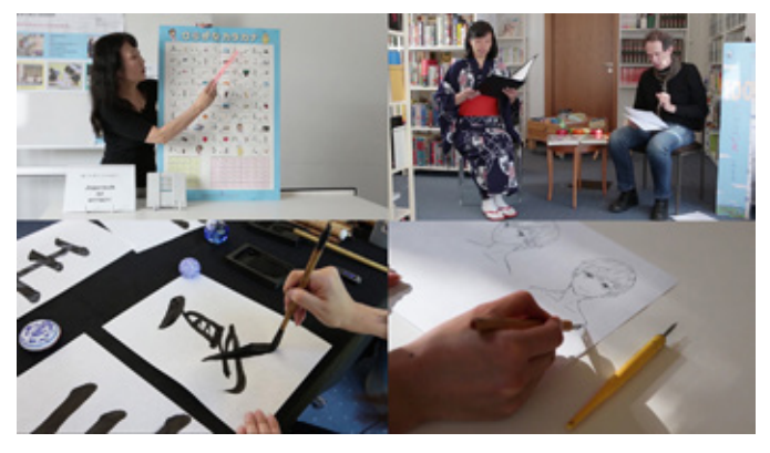
The 2020 Open House held on 13 June was turned into a virtual day with a 4-hour video program and many online offerings, streamed via the JDZB Facebook page and YouTube, starting at 2 p.m. – it was the first successful digital experiment.

Photo right: Annual conference to mark the 30<sup>th</sup> anniversary of the Association for Social Science Research on Japan (VSJF) on the topic "Social Science Research and Society in Japan and Germany: Impact, Institutions and Perspectives," 23-25 November 2018 at the JDZB.