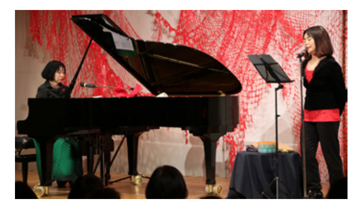
Photo above: "Carmen X Cage" on 15 January 2019: Five internationally renowned artists present an exciting performance of music, sound, words and art installation. Pictured left is jazz pianist TAKASE Aki, right is writer TAWADA Yōko.

Photo above right: Festive Japanese Nō dance performance, to celebrate the 50<sup>th</sup> anniversary of the establishment of the Japanese Cultural Institute Cologne and 25 years of sister city partnership Tōkyō – Berlin, on 3 September 2019 at the Berlin Philharmonic, as part of the Musikfest Berlin in cooperation with the Japan Foundation and the JDZB.