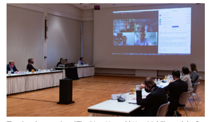
The virtual symposium "The 'New Normal,' New Mobility and the Future of the City" took place with a livestream from the JDZB on 24 August 2020. It was the first of several JDZB conferences that were held in hybrid mode (with partial in-person attendance) due to the pandemic.