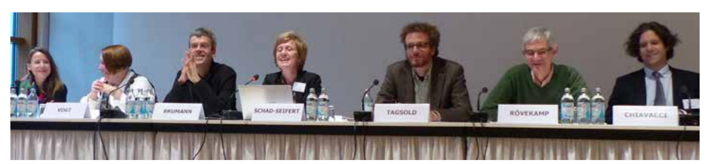
Board of the Association for Social Science Research (Vereinigung für sozialwissenschaftliche Japanforschung) at the 2013 annual meeting, held at the JDZB from 22 to 24 November 2013 with the topic "Inequality in Post-Growth Japan: Social Transformation during Economic and Demographic Stagnation".