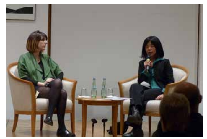
Opening of the exhibition "Out of Sight." Poems – Photographs by Tawada Yôko and Delphine Parodi-Nagaoka on 7 February 2014 at the JDZB with a reading by Tawada Yôko.